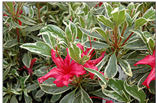
Girard's Variegated Gem Azalea flowers