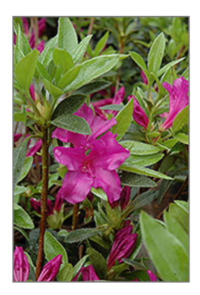
Blue Danube Azalea flowers

Blue Danube Azalea is covered in stunning clusters of violet trumpet-shaped flowers with deep purple spots at the ends of the branches in mid spring. It has green evergreen foliage which emerges light green in spring. The glossy narrow leaves remain green throughout the winter.