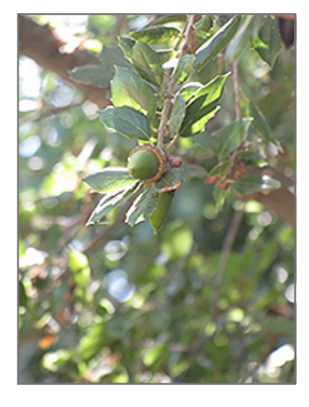
Holm Oak foliage

This tree should only be grown in full sunlight. It is very adaptable to both dry and moist locations, and should do just fine under average home landscape conditions. It is not particular as to soil type or pH. It is highly tolerant of urban pollution and will even thrive in inner city environments. This species is not originally from North America.