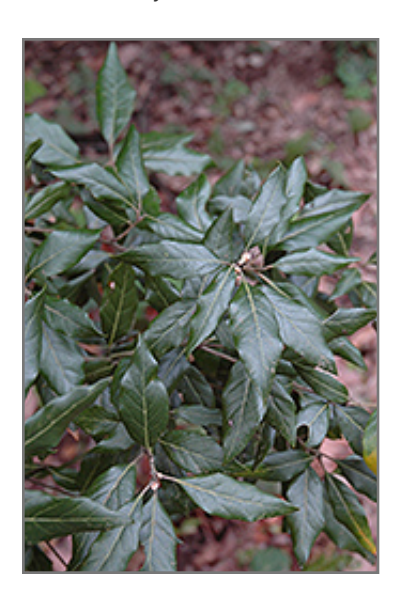
Holm Oak foliage