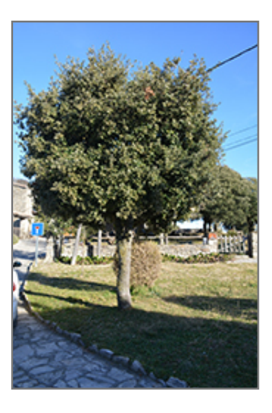
Holm Oak

Holm Oak is recommended for the following landscape applications: