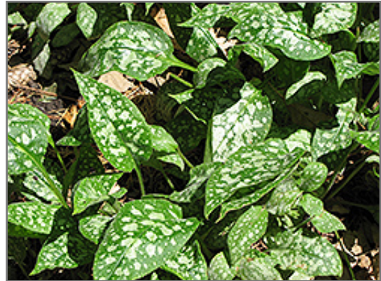
Regal Ruffles Lungwort foliage

Other Names: Lords And Ladies, Bethlehem Sage