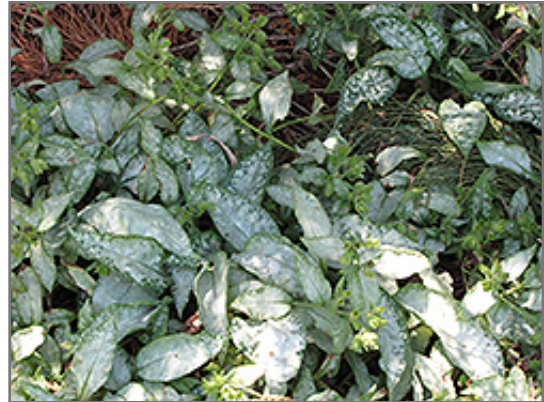
Northern Lights Lungwort foliage