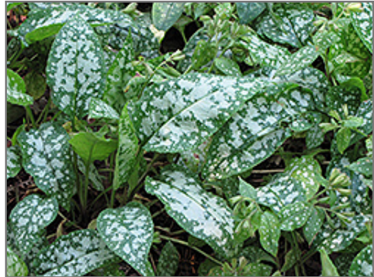
British Sterling Lungwort foliage

Other Names: Lords And Ladies, Bethlehem Sage