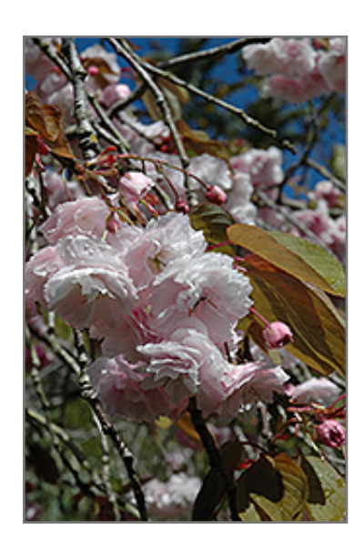
White Flowering Cherry flowers