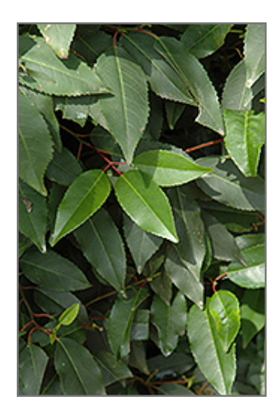
Portugal Laurel foliage

This tree does best in full sun to partial shade. It does best in average to evenly moist conditions, but will not tolerate standing water. It is not particular as to soil pH, but grows best in rich soils, and is able to handle environmental salt. It is highly tolerant of urban pollution and will even thrive in inner city environments. This species is not originally from North America.