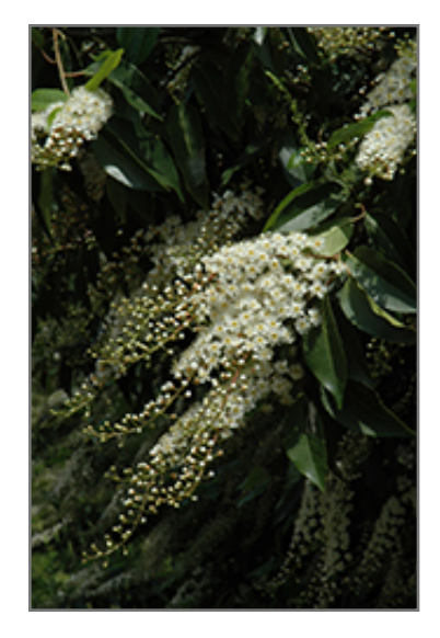
Portugal Laurel flowers

Portugal Laurel is recommended for the following landscape applications;