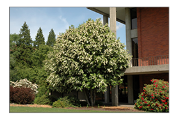
Portugal Laurel in bloom