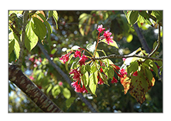
Taiwan Cherry flowers