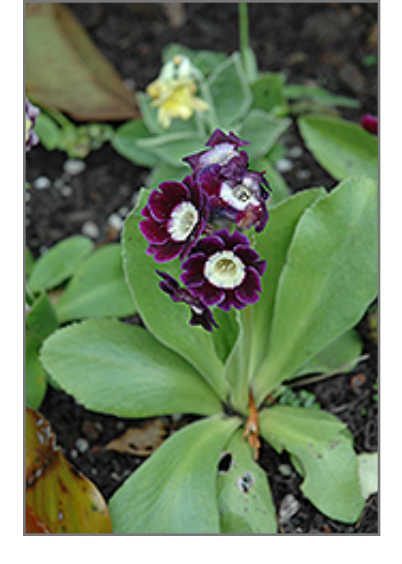
Border Primrose flowers

A low growing perennial with bright, usually bi-colored blooms in combinations of yellow, white, pink, purple, or red, and are often fragrant; leaves tend to mature to gray-green; a colorful display in a border or container