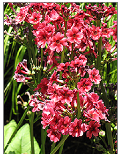
Miller's Crimson Primrose flowers