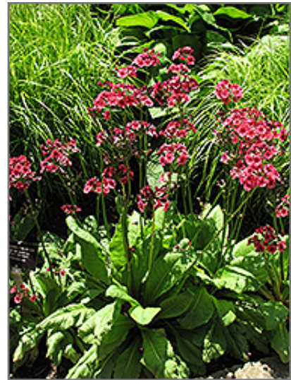
Miller's Crimson Primrose in bloom

Miller's Crimson Primrose is recommended for the following landscape applications;