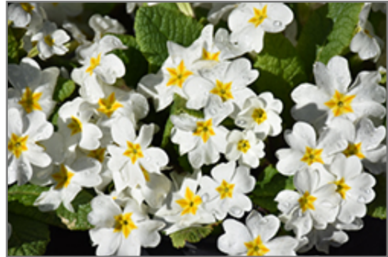
Fairy Primrose flowers