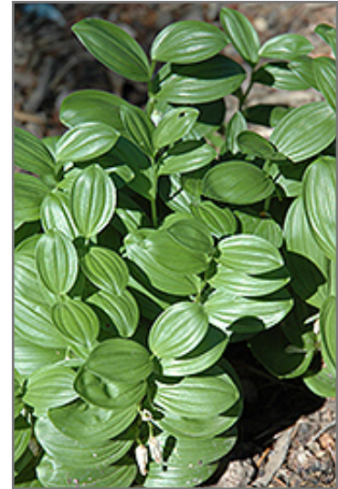
Fred Case Solomon's Seal foliage

A dwarf form with pleated deep green leaves and dangling white flowers borne under the leaves, followed by bluish-black inedible fruit; great for shady rock gardens and woodlands; tolerates a wide variety of soil conditions