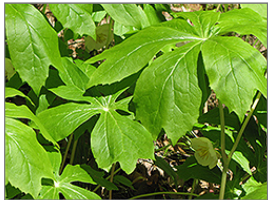
Mayapple foliage