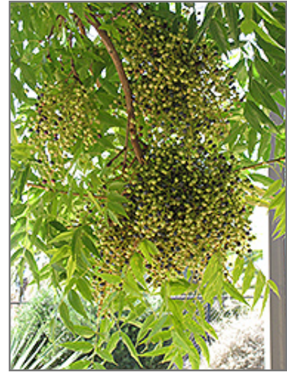
Chinese Pistache fruit

This tree should only be grown in full sunlight. It is very adaptable to both dry and moist growing conditions, but will not tolerate any standing water. It is not particular as to soil type or pH. It is highly tolerant of urban pollution and will even thrive in inner city environments. This species is not originally from North America.