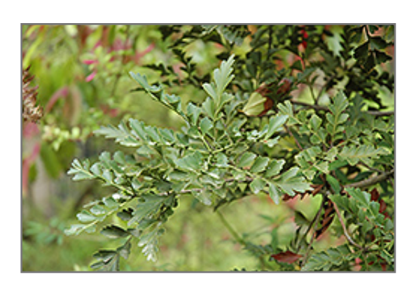
Celery Pine foliage

A small to medium size tree that can be maintained as a shrub; the leaves are sparse, tiny and scale like, photosynthesis is performed by modified, flattened, green leaf stems that mimic leaves, giving a ferny look akin to celery foliage