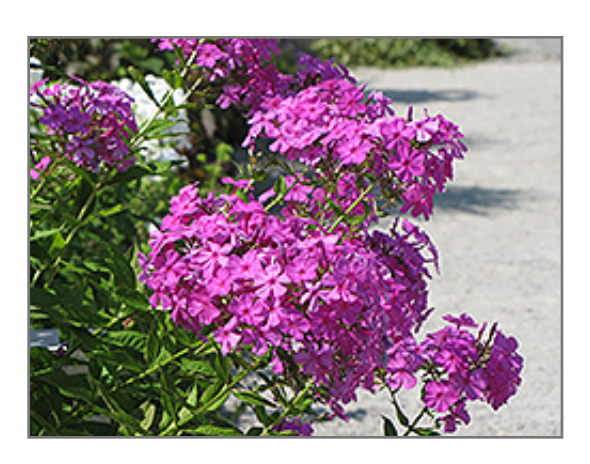
Robert Poore Garden Phlox flowers

Outstanding fragrant pink flowers that bloom prolifically all summer; suitable for containers or small perennial borders; good mildew resistance