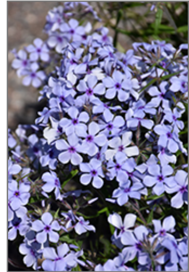
Chattahoochee Phlox flowers

A choice variety with overlapping petals of passionate deep blue fragrant flowers that bloom in mid to late spring; a wonderful plant for borders and edging; not prone to mildew, and grows best in slightly dry conditions