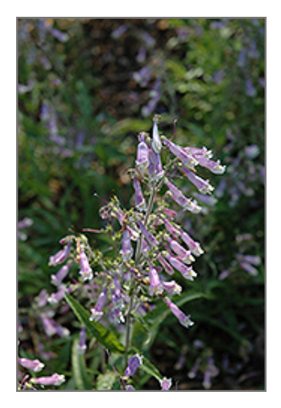
Hairy Beard Tongue flowers

A lovely variety that mounds medium green foliage; deep purple fuzzy stems uphold glorious lavender blooms with white throats and tips that are great for visual impact; plants are vigorous and very drought tolerant