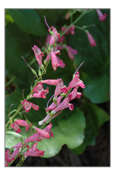
Rose Elf Beard Tongue flowers

This spring flowering variety is semi-evergreen; avoid planting in clay; flowering is best in cooler weather; remove spent flowers to encorage re-blooming; produces lovely pink tubular flowers