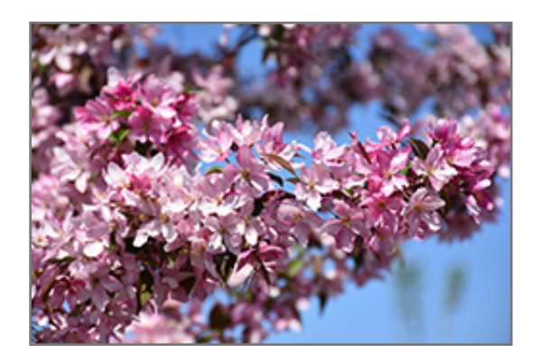
Pink Spires Flowering Crab flowers

This is a high maintenance tree that will require regular care and upkeep, and is best pruned in late winter once the threat of extreme cold has passed. Gardeners should be aware of the following characteristic(s) that may warrant special consideration;