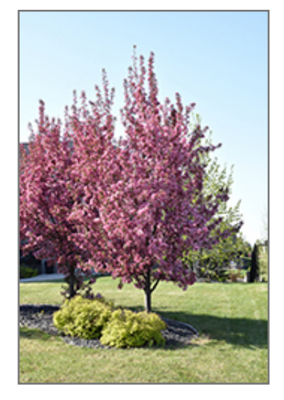
Pink Spires Flowering Crab in bloom

Pink Spires Flowering Crab is a deciduous tree with a distinctive and refined pyramidal form. Its average texture blends into the landscape, but can be balanced by one or two finer or coarser trees or shrubs for an effective composition.