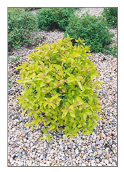
Golden Dogwood