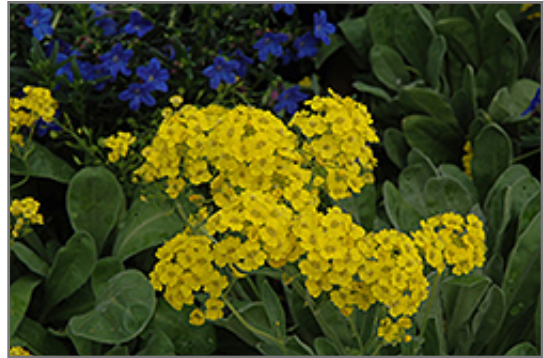
Basket Of Gold Alyssum flowers

Basket Of Gold Alyssum is recommended for the following landscape applications;