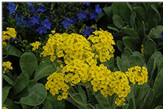
Basket Of Gold Alyssum flowers

Basket Of Gold Alyssum is recommended for the following landscape applications;