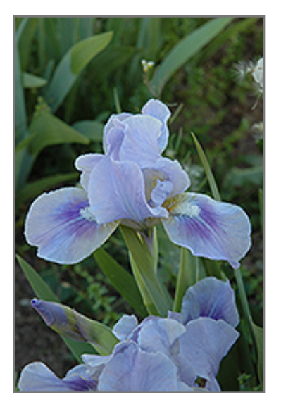
Snappy Iris flowers

Snappy Iris has masses of beautiful lavender flag-like flowers with sky blue overtones and a lemon yellow beard at the ends of the stems in mid spring, which are most effective when planted in groupings. The flowers are excellent for cutting. Its sword-like leaves remain green in colour throughout the season.