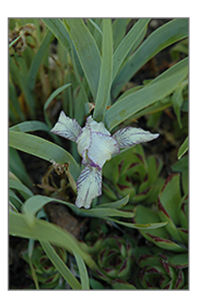
Pixie's Sister Iris flowers

Pixie's Sister Iris has masses of beautiful white flag-like flowers with purple veins at the ends of the stems in mid spring, which are most effective when planted in groupings. The flowers are excellent for cutting. Its sword-like leaves remain green in colour throughout the season.