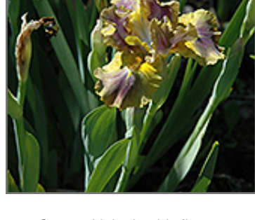
Grease Lightning Iris flowers

Grease Lightning Iris has masses of beautiful yellow flag-like flowers with white throats and lilac purple falls at the ends of the stems in mid spring, which are most effective when planted in groupings. The flowers are excellent for cutting. Its sword-like leaves remain green in colour throughout the season.