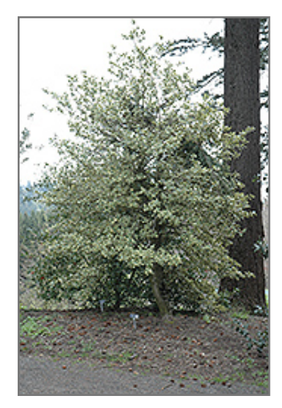
Wil-Chris Holly