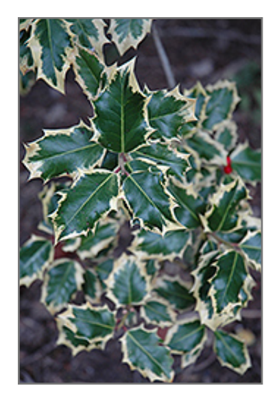
Wil-Chris Holly foliage