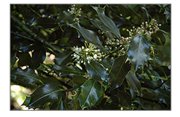
Sunnybrook Holly flowers

A choice broadleaf evergreen with the distinctive holly leaves which are wonderfully glossy; a refined variety that can grow quite tall