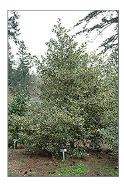
Ivory Holly