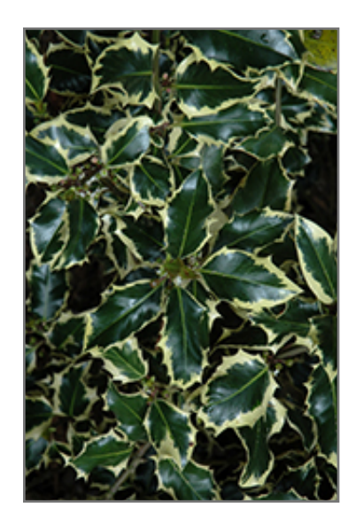
Ivory Holly foliage