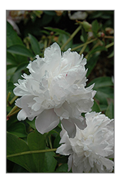
Sarah Carstensen Peony flowers