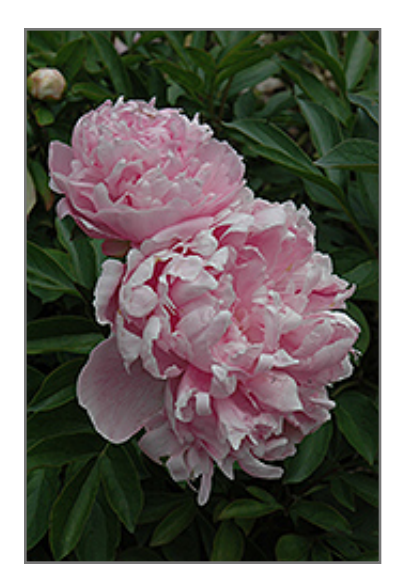
Mrs. Livingston Ferrand Peony flowers