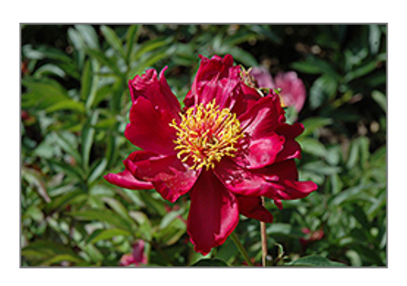
Meteor Peony flowers

Meteor Peony features bold fragrant hot pink flowers with yellow eyes at the ends of the stems from late spring to early summer. The flowers are excellent for cutting. Its compound leaves remain green in colour throughout the season.