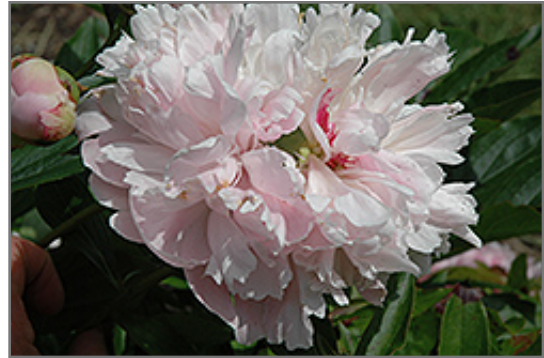
Marie d'Hour Peony flowers

Marie d'Hour Peony will grow to be about 30 inches tall at maturity, with a spread of 3 feet. When grown in masses or used as a bedding plant, individual plants should be spaced approximately 30 inches apart. The flower stalks can be weak and so it may require staking in exposed sites or excessively rich soils. It grows at a slow rate, and under ideal conditions can be expected to live for approximately 20 years. As an herbaceous perennial, this plant will usually die back to the crown each winter, and will regrow from the base each spring. Be careful not to disturb the crown in late winter when it may not be readily seen!