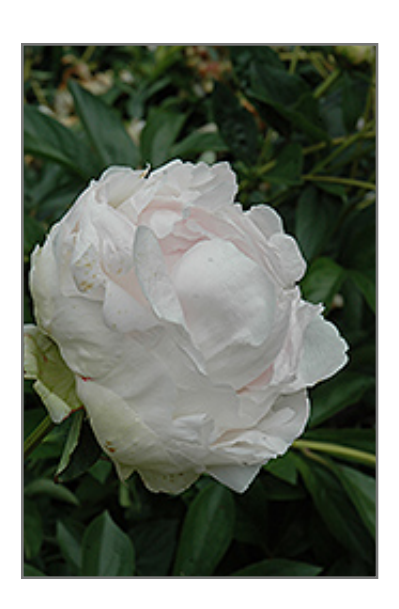
Loveliness Peony flowers

Loveliness Peony will grow to be about 30 inches tall at maturity, with a spread of 3 feet. When grown in masses or used as a bedding plant, individual plants should be spaced approximately 30 inches apart. The flower stalks can be weak and so it may require staking in exposed sites or excessively rich soils. It grows at a slow rate, and under ideal conditions can be expected to live for approximately 20 years. As an herbaceous perennial, this plant will usually die back to the crown each winter, and will regrow from the base each spring. Be careful not to disturb the crown in late winter when it may not be readily seen!