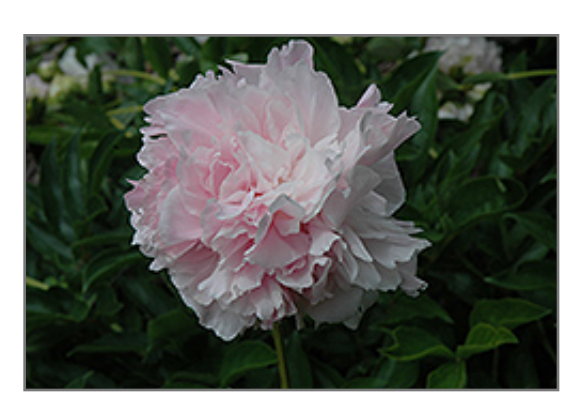
Louisa Brand Peony flowers

Louisa Brand Peony features bold fragrant double white flowers at the ends of the stems from late spring to early summer. The flowers are excellent for cutting. Its compound leaves remain green in colour throughout the season.