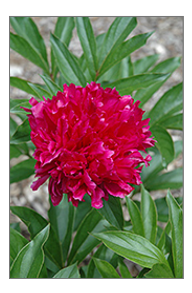
Gloire de Touraine Peony flowers