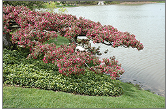
Candied Apple Flowering Crab in bloom