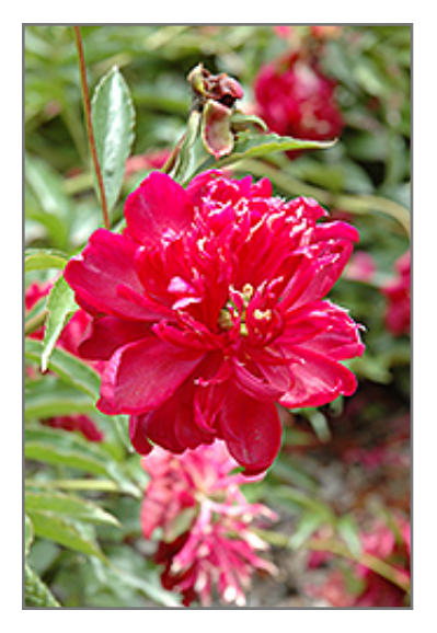
Fujayo Peony flowers

Fujayo Peony will grow to be about 30 inches tall at maturity, with a spread of 3 feet. When grown in masses or used as a bedding plant, individual plants should be spaced approximately 30 inches apart. The flower stalks can be weak and so it may require staking in exposed sites or excessively rich soils. It grows at a slow rate, and under ideal conditions can be expected to live for approximately 20 years. As an herbaceous perennial, this plant will usually die back to the crown each winter, and will regrow from the base each spring. Be careful not to disturb the crown in late winter when it may not be readily seen!