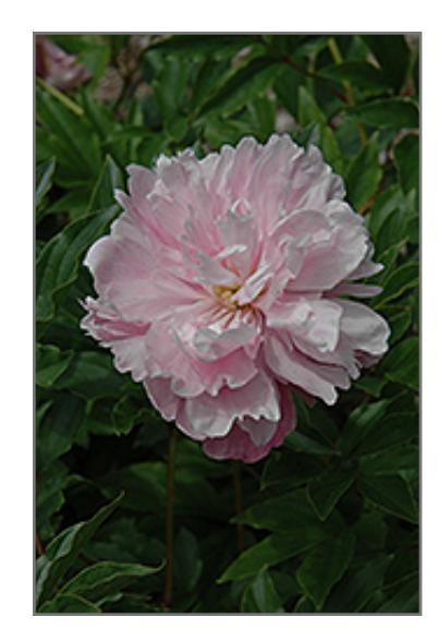
Duke of Devonshire Peony flowers