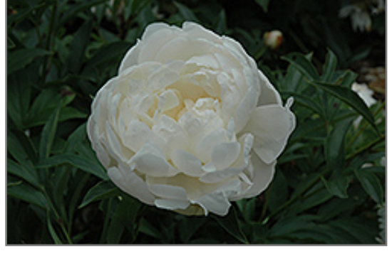
Claude Gelee Peony flowers

Claude Gelee Peony will grow to be about 30 inches tall at maturity, with a spread of 3 feet. When grown in masses or used as a bedding plant, individual plants should be spaced approximately 30 inches apart. The flower stalks can be weak and so it may require staking in exposed sites or excessively rich soils. It grows at a slow rate, and under ideal conditions can be expected to live for approximately 20 years. As an herbaceous perennial, this plant will usually die back to the crown each winter, and will regrow from the base each spring. Be careful not to disturb the crown in late winter when it may not be readily seen!