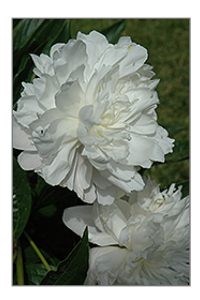
Betty Blossom Peony flowers

Betty Blossom Peony will grow to be about 30 inches tall at maturity, with a spread of 3 feet. When grown in masses or used as a bedding plant, individual plants should be spaced approximately 3 feet apart. The flower stalks can be weak and so it may require staking in exposed sites or excessively rich soils. It grows at a slow rate, and under ideal conditions can be expected to live for approximately 20 years. As an herbaceous perennial, this plant will usually die back to the crown each winter, and will regrow from the base each spring. Be careful not to disturb the crown in late winter when it may not be readily seen!