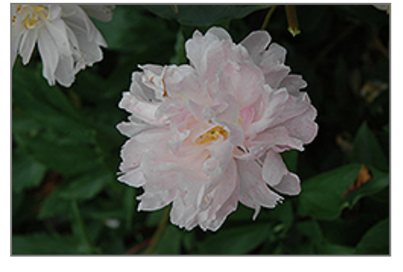
Bellsaire Peony flowers

Bellsaire Peony will grow to be about 30 inches tall at maturity, with a spread of 3 feet. When grown in masses or used as a bedding plant, individual plants should be spaced approximately 30 inches apart. The flower stalks can be weak and so it may require staking in exposed sites or excessively rich soils. It grows at a slow rate, and under ideal conditions can be expected to live for approximately 20 years. As an herbaceous perennial, this plant will usually die back to the crown each winter, and will regrow from the base each spring. Be careful not to disturb the crown in late winter when it may not be readily seen!