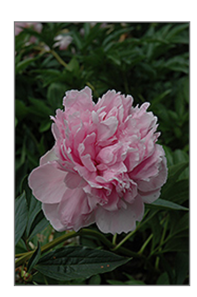
Archie Brand Peony flowers

Archie Brand Peony will grow to be about 30 inches tall at maturity, with a spread of 3 feet. When grown in masses or used as a bedding plant, individual plants should be spaced approximately 30 inches apart. The flower stalks can be weak and so it may require staking in exposed sites or excessively rich soils. It grows at a slow rate, and under ideal conditions can be expected to live for approximately 20 years. As an herbaceous perennial, this plant will usually die back to the crown each winter, and will regrow from the base each spring. Be careful not to disturb the crown in late winter when it may not be readily seen!