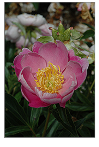
Apple Blossom Peony flowers

Apple Blossom Peony is an herbaceous perennial with a more or less rounded form. Its medium texture blends into the garden, but can always be balanced by a couple of finer or coarser plants for an effective composition.