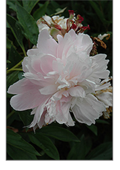
Walter McClelland Peony flowers

Walter McClelland Peony features bold lightly-scented double pink flowers at the ends of the stems from late spring to early summer. The flowers are excellent for cutting. Its compound leaves emerge burgundy in spring, turning green in colour throughout the season.