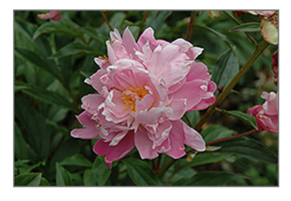
Suzette Peony flowers