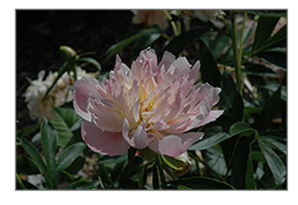
Standard Bearer Peony flowers