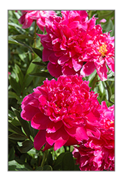
Shawnee Chief Peony flowers