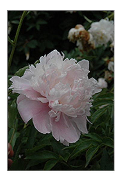
Ruth Brand Peony flowers