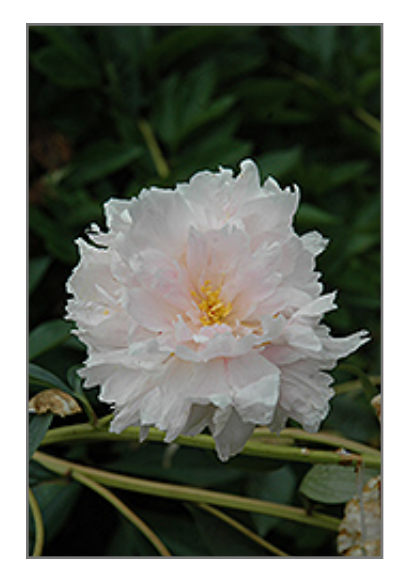
Reine Hortense Peony flowers

Pretty, light rose-pink double flowers have a silvery sheen and subtle red streaking; fragrant and late blooming